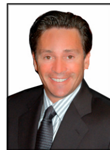
Mitch Gaylord www.MitchGaylord.com 817-337-6808

GET "IT" - Success, Achievement, ultimate Fulfillment.